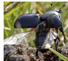
More than half of Earth's species live in the soil, study finds

Or email us to reserve your place: bhecohub@gmail.com