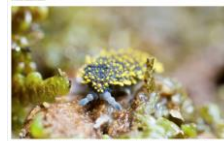
a genus of giant springtails that lives in the soil.

Soil estimated to be home to 90% of world's fungi, 25% of plants and more than 90% of bacteria, making it the world's most species-rich habitat